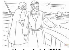
Version 4 : July 2019

08 DAYS 05 NIGHTS (overland to Istanbul)